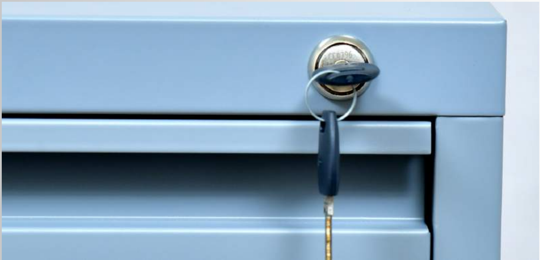
Secured Central Lock