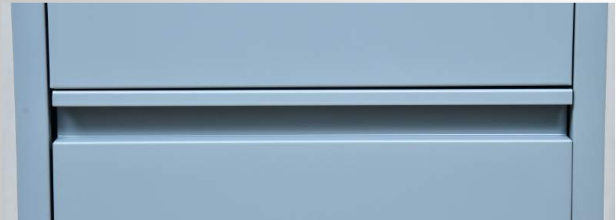
Recessed Type Drawer Handle