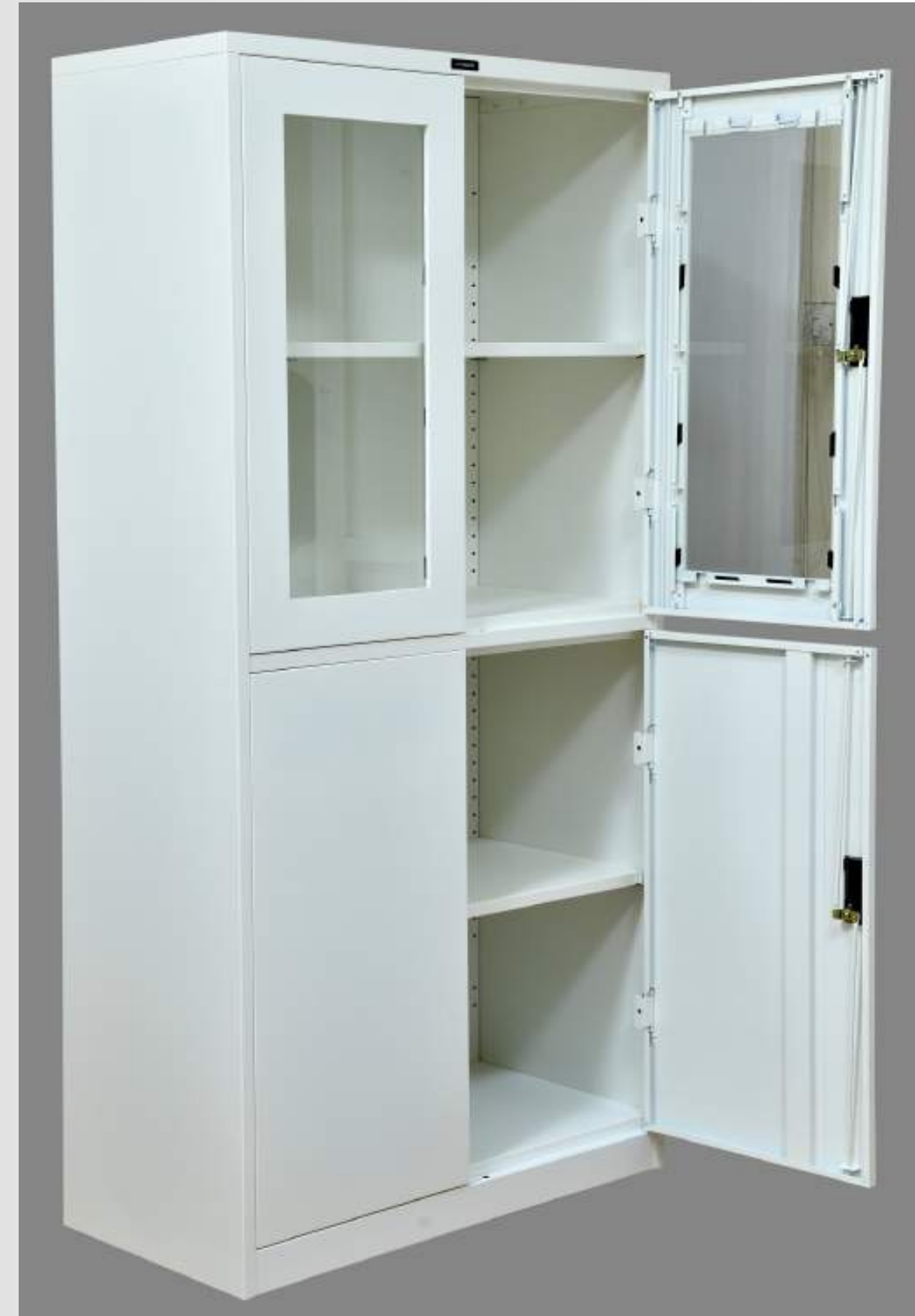
Secured Lock Cum Handle