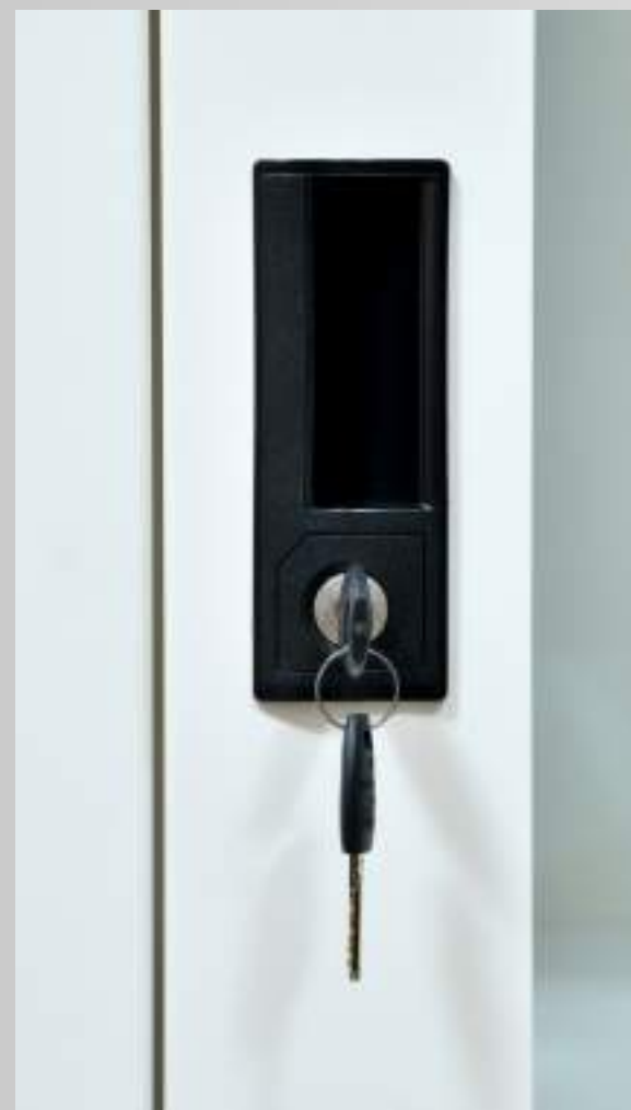
Secured Lock Cum Handle