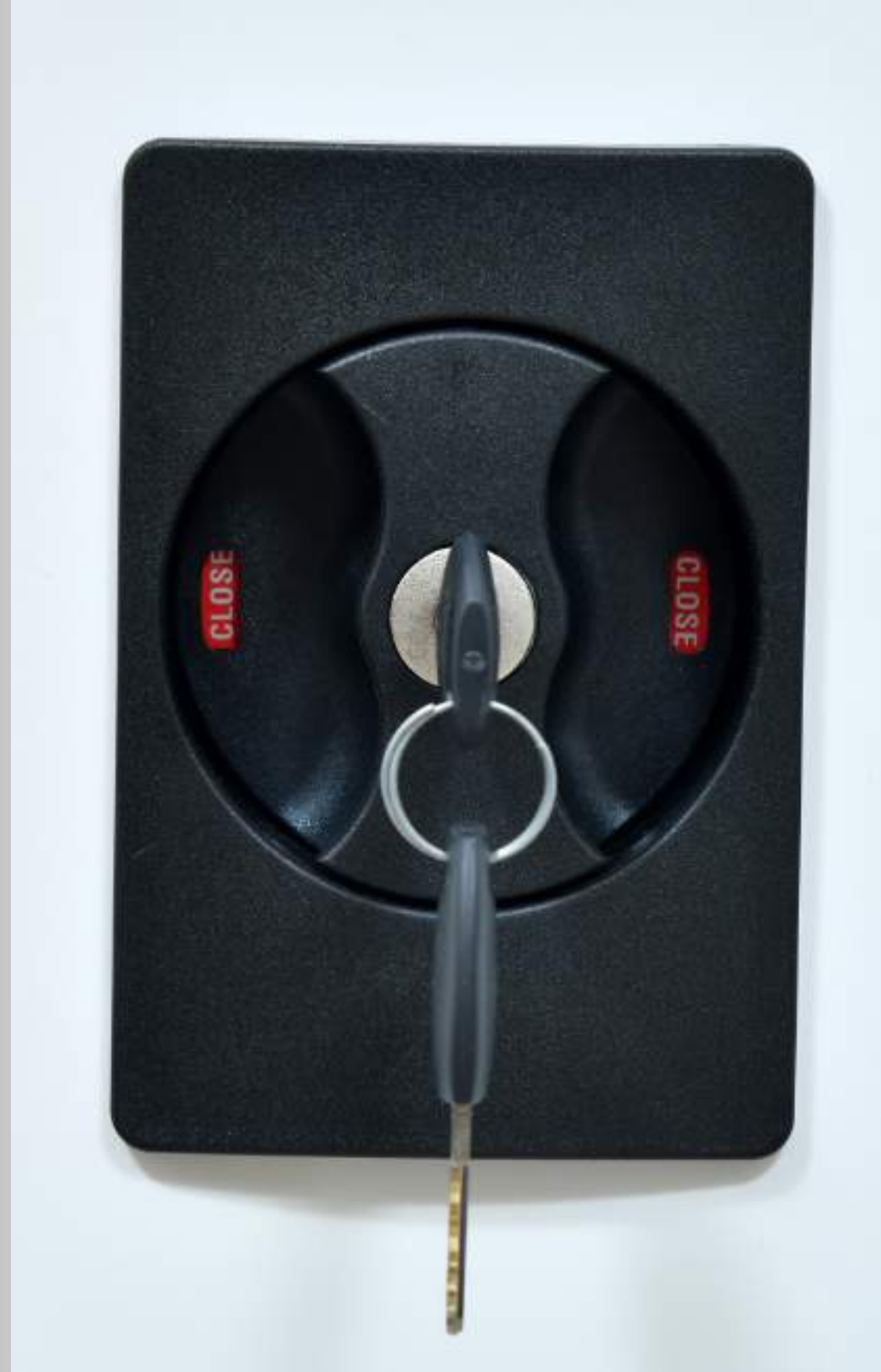
Secured Lock Cum Handle