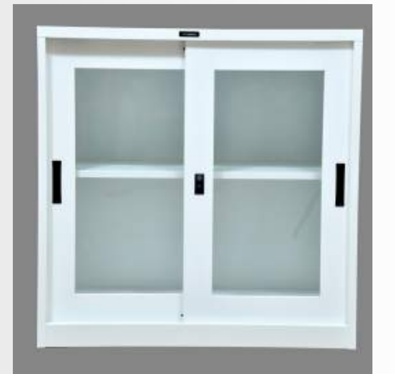
Half-Height Glass Sliding Door Storage