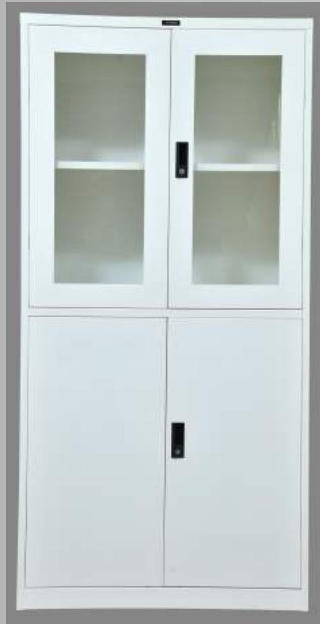
Full Height Glass Swing Door Storage