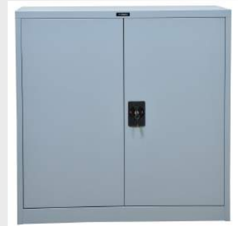
Half-height Swing Door Storage