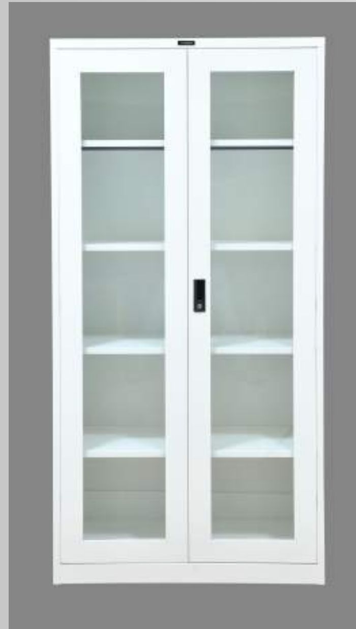
Full Height Swing Door Storage